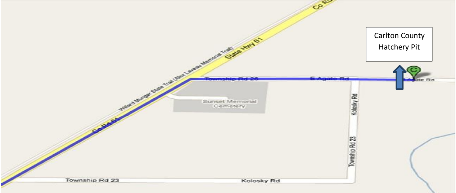
Hatchery Pit (~4 miles from the Chamber office) State Highway 73 north (Arrowhead Lane) to County Highway 61 North to E Agate Road, 1/2 mile to pit entrance.