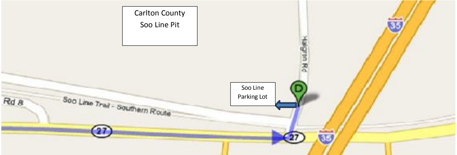
Soo Line Pit – (~2.7 miles from the Chamber office) north on State Highway 73 (Arrowhead Lane) changes to Highway 27 north, left to Halgren Road ~3/4 mile walk to pit entrance.