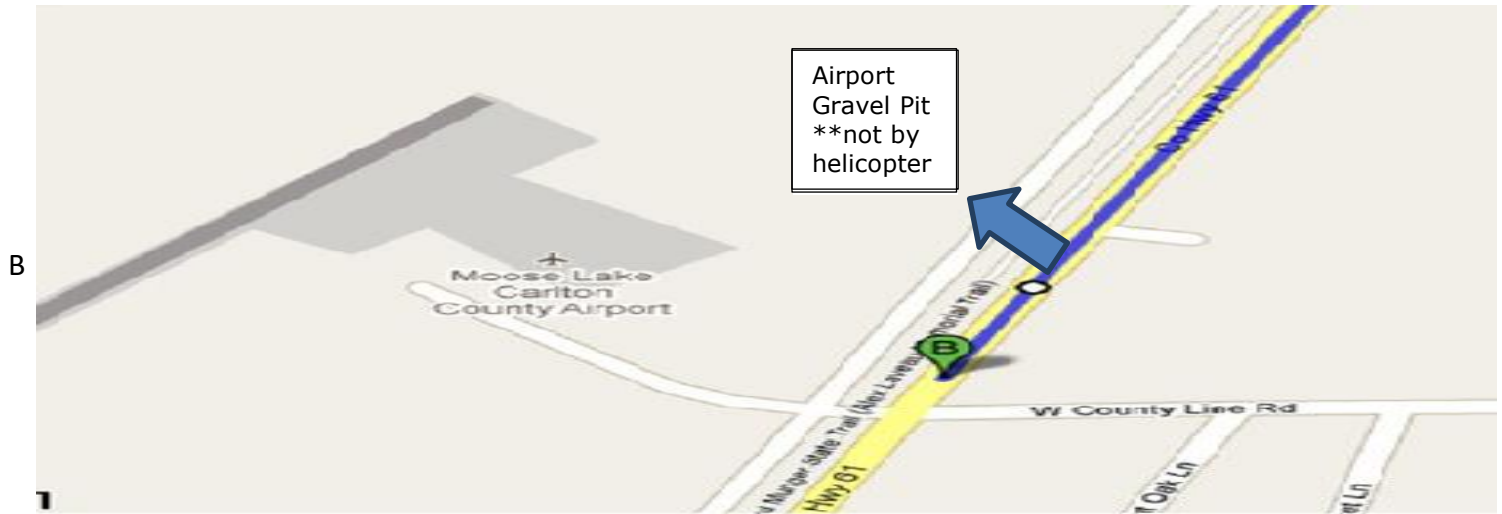
Carlton County Airport Pit (~2 miles from the Chamber office) – County Highway 61 South, right to pit entrance. Look for white sign on tree, it is a small gravel road. Note a small white cross near the entrance on 61. Park in front of barricade, then walk around to enter. DO NOT venture too far to the left as you will be entering Airport property and they may come and tell you to leave.