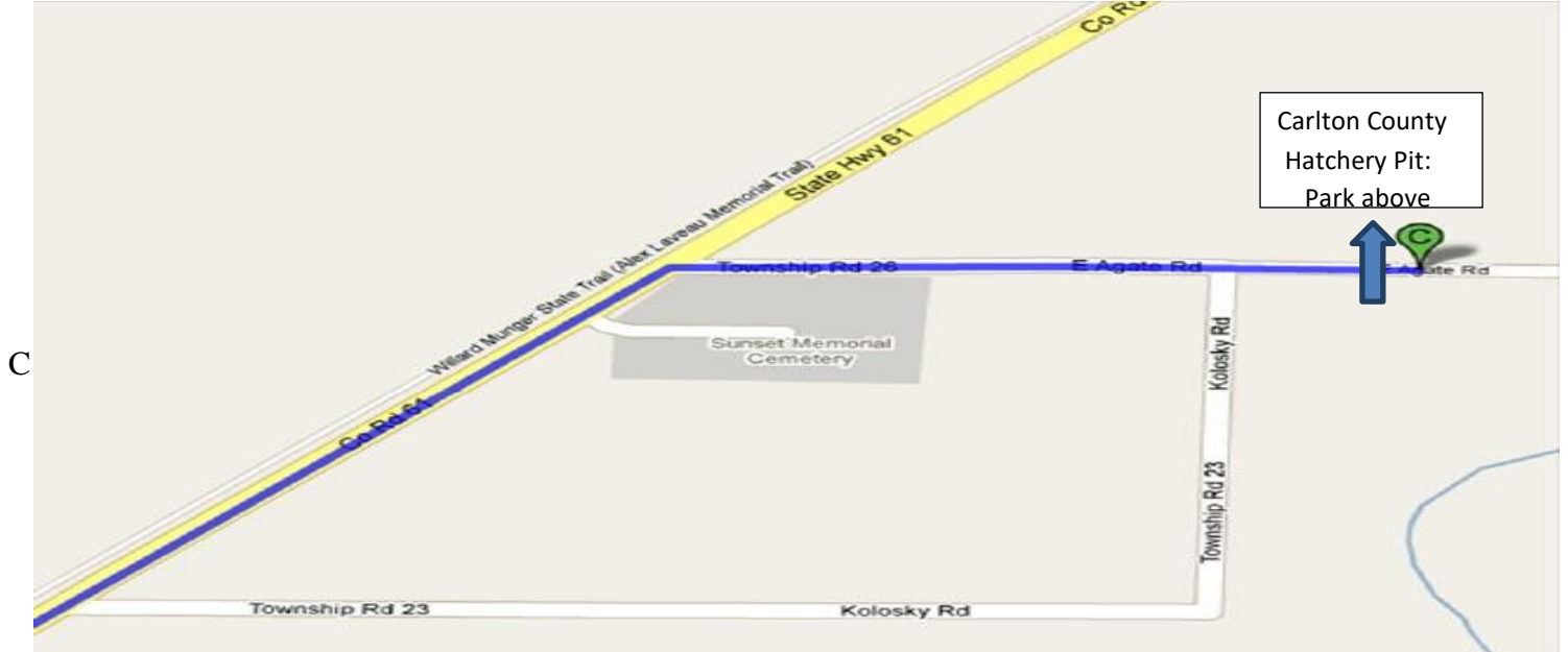
Hatchery Pit (~4 miles from the Chamber office) State Highway 73 north (Arrowhead Lane) to County Highway 61 North to E Agate Road turning just after Sunset Memorial Cemetery. Drive ½ mile to pit entrance and park above, DO NOT drive down into pit.