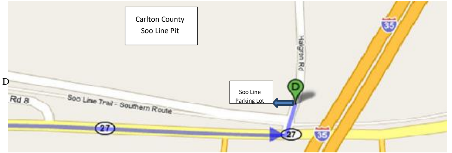
Soo Line Pit – (~2.7 miles from the Chamber office) north on State Highway 73 (Arrowhead Lane) changes to Highway 27 north, left to Halgren Road ~3/4 mile walk to pit entrance. This is the longest walk from parking to the pit. It is about a 10-15 minute walk.